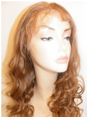
Indian Remy Custom Big Body Curl