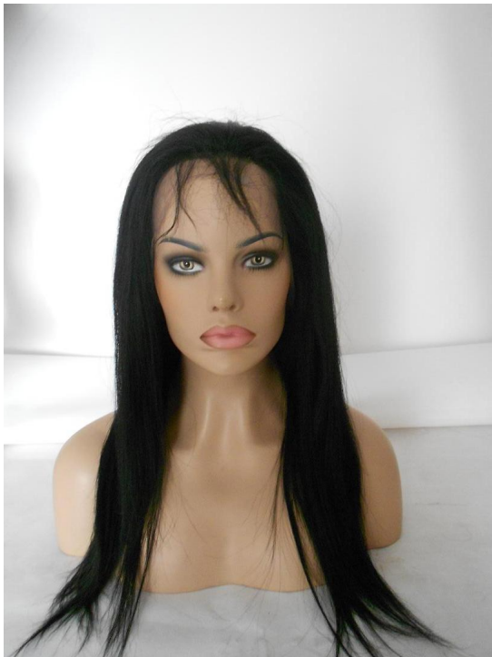
Indian Remy Straight Color #1