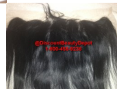
13x6 Custom Order Color #2