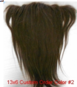
13x6 Custom Order Color #2