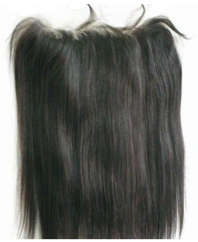
Straight Lace Frontal