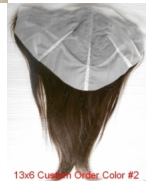
13x6 Custom Order Color #2