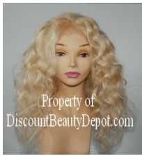
Big Body Curly Full Lace Wig