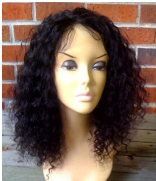
Full Lace Indian Remy Wig