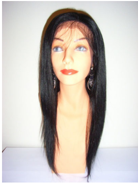
Indian Remy Full Lace Wig Color #1