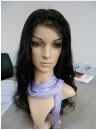
Glueless Cap Silky Top Malaysian