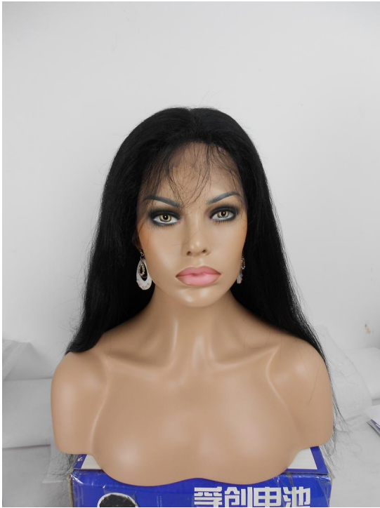
Silky Top Full Lace Wig Color #1