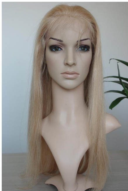
Custom Euro Straight Wig