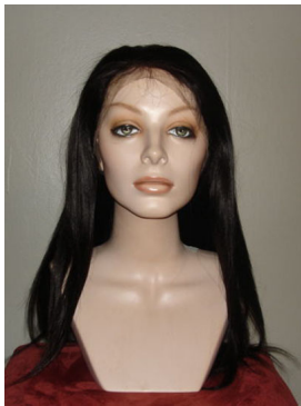
Silky Straight Color #1