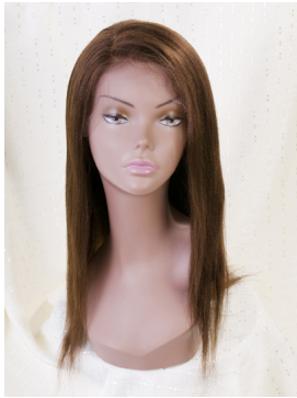
Color#4 Silky Straight Full Lace Wig