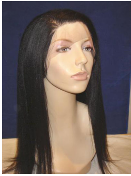
Yaki Straight Full Lace Wig