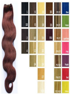
Body Wavy Skin Weft