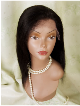
Straight Full Lace Indian Remy Silky