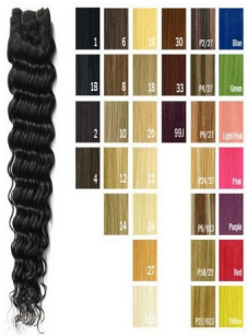
Deep Wavy Skin Weft Extensions