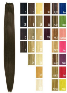
Straight Skin Weft Extensions