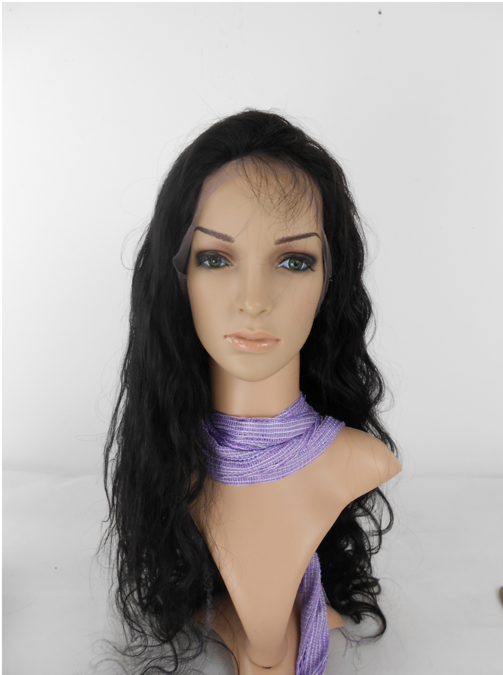
Brazilian Wavy Full Lace Wig Color