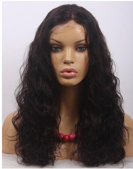
Chinese Wavy Full Lace Wig Color #1