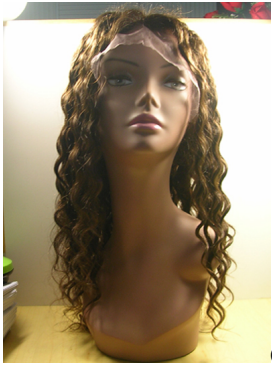
Custom Wavy Wig with Highlights