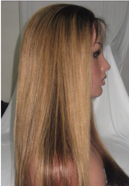
Custom Straight Two Tone Full Lace Wigs