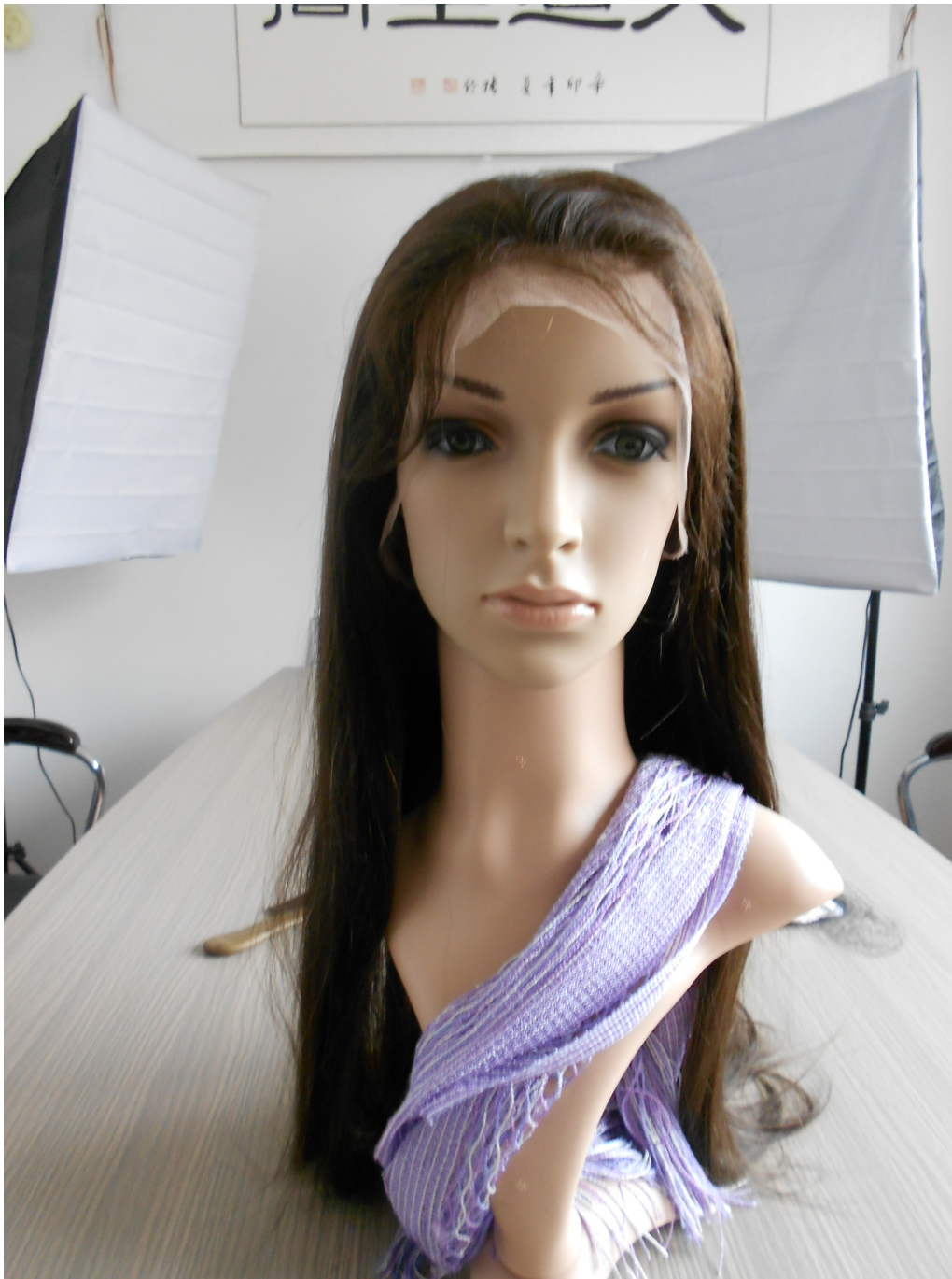
Straight Chinese Full Lace Wig