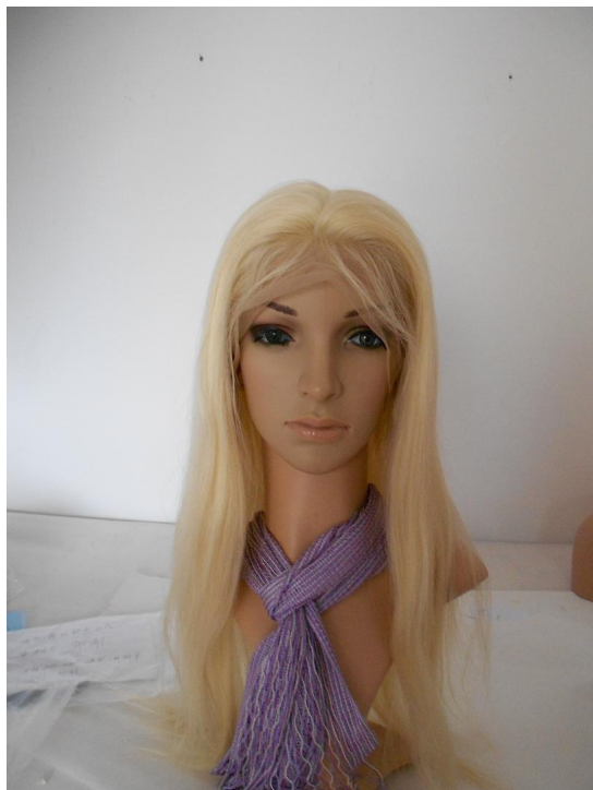
Chinese #613 Platinum Blonde Full Lace Wig