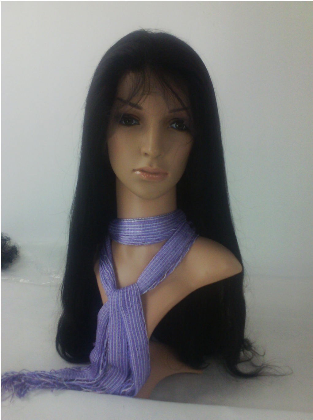
Malaysian Straight 24