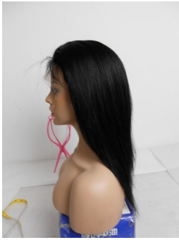
Malaysian Straight Color #1 12