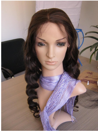
Malaysian Body Wave Color #2