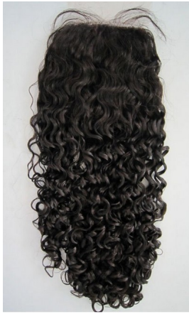
Curly Silky Top Closure