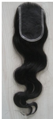
Body Wavy Top Closure