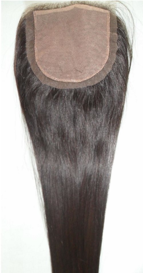
Straight Silk Top Closure