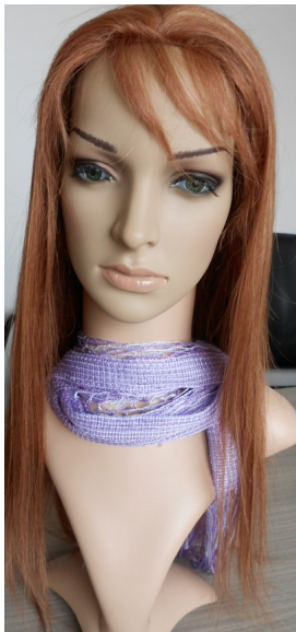
Europeaan Straight Wig Color #30