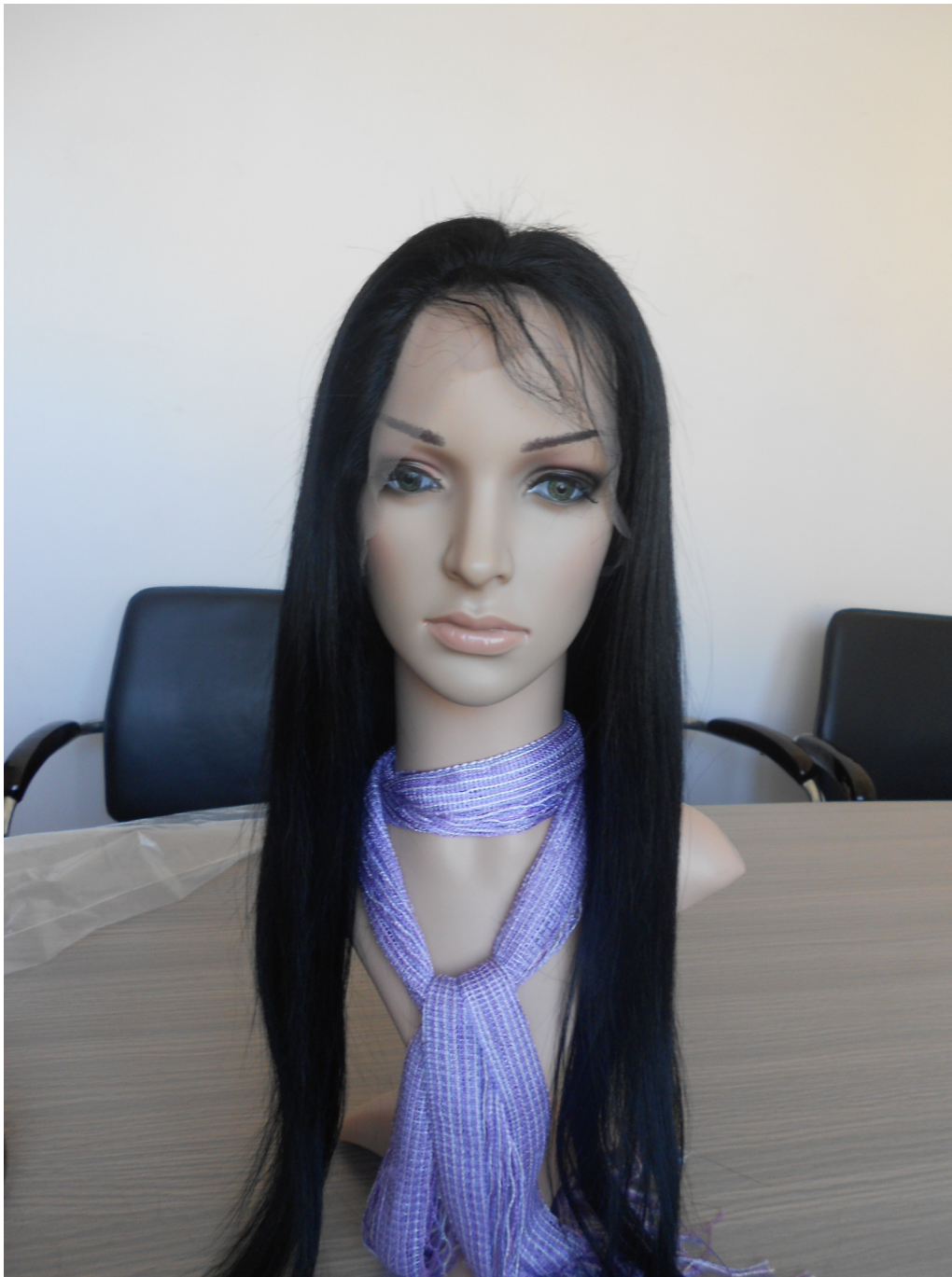
Brazilian Wavy Full Lace Wig Color