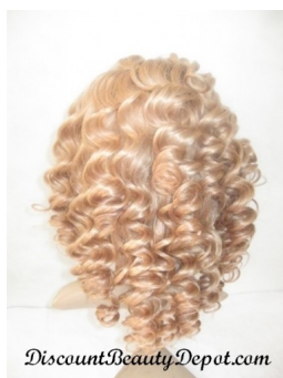
Tight Curly Brazilian Color #10