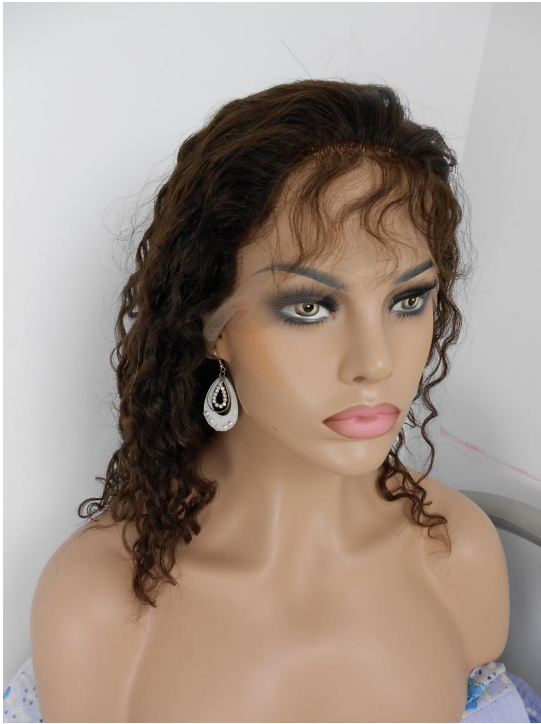
Wet n Wavy Color #2 Full Lace Wig